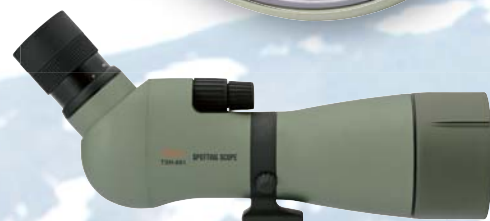
TSN-881 High Grade Normal Lens Angled type