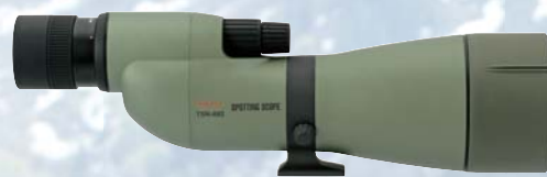
TSN-882 High Grade Normal Lens Straight type