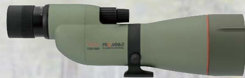
TSN-884 PROMINAR Fluorite Crystal Straight type