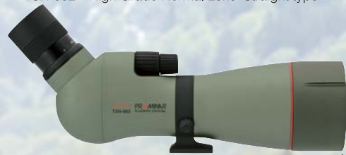
TSN-883 PROMINAR Fluorite Crystal Angled type